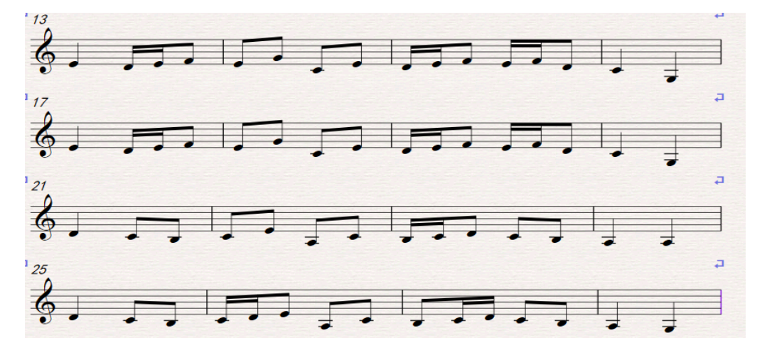
Music example 6: the melody of "Grassland in Central Asia"