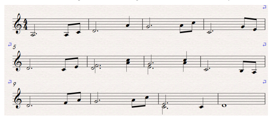
Music example 2 "Leave Chang 'an" string music