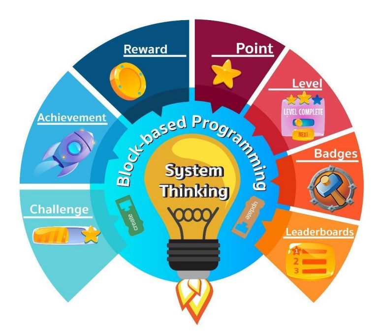
Image 2. The Learning Environment Based on Gamification and Block-based Programming to Promote Systems Thinking Capability

4. The result of the suitability evaluation of the learning environment is shown in Table 2.